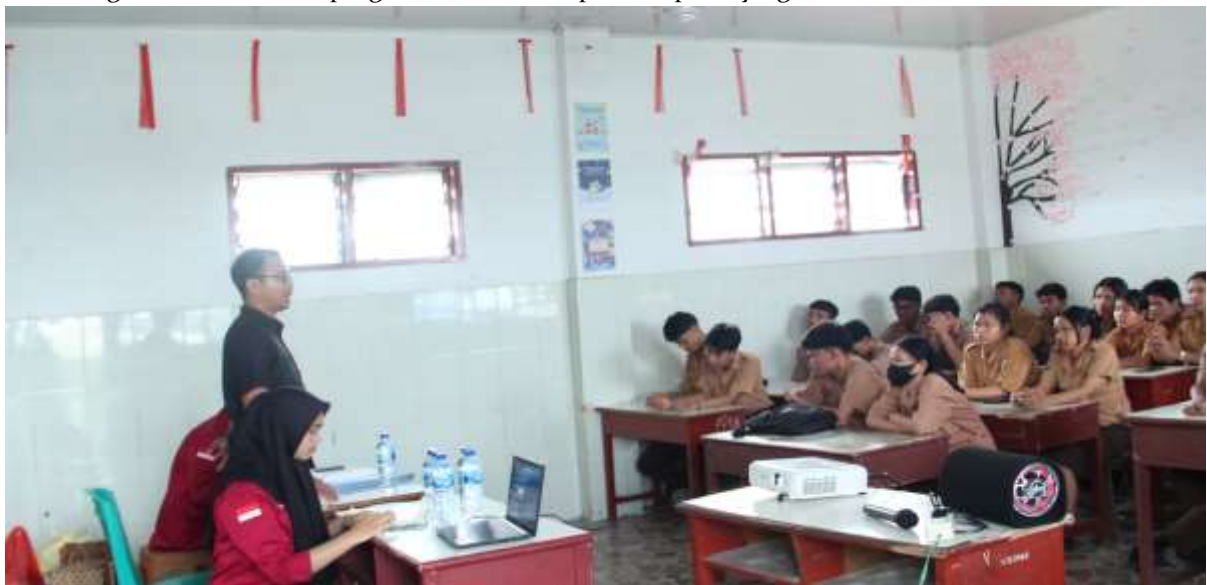
Figure 2. Resource Persons Delivering Material to Students

The goal of community service activities at APIPSU Medan High School is to prevent bullying by educating students about child protection laws and offering counseling. On January 18, 2025, the stages of this counseling activity will take place. High school kids are among the people this advice is aimed at. Interacting with the pupils was the socializing exercise that was done. The principal greeted the opening and gave a quick explanation of the counseling event's goal before asking for information on bullying instances. The image below shows socializing exercises with pupils who are part of child protection laws' counseling and socialization programs in an attempt to stop bullying.